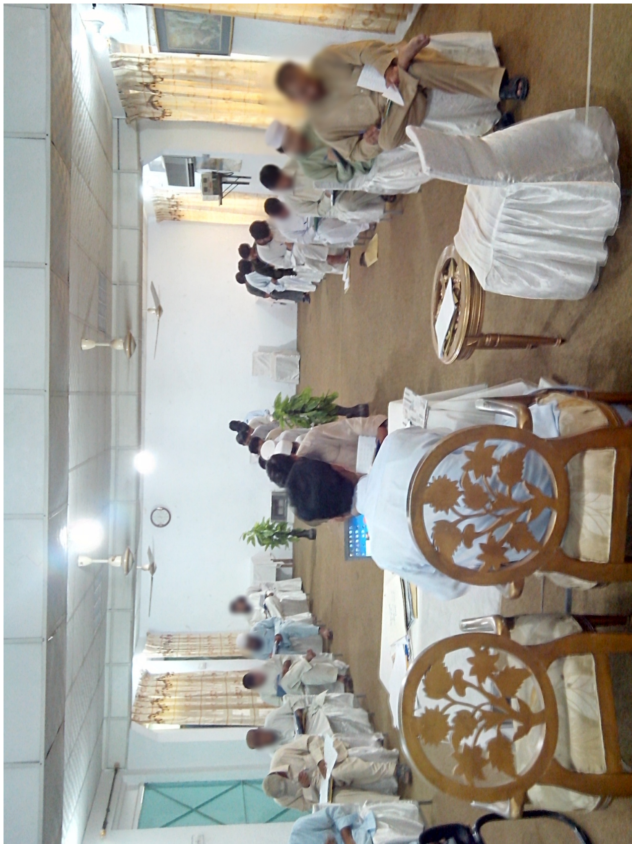
Figure A.5: Experiment Session in Peshawar