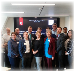
IU ANU Group Photo

The Program on Cybersecurity and Internet Governance, brings together scholars from across Indiana University and beyond to build scholarly networks, as well as seek out partnerships with managers and policymakers in the United