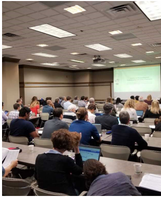
Panel at WOW6 Conference

Held every five years since 1994, WOW6, held June 19 - 21, enabled researchers, students, and alumni from the Ostrom Workshop to reconnect for presentations and discussions of their work and areas of common interest.