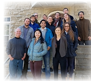
Young Scholars Symposium

The Program on Natural Resource Governance has developed a network of scholars to examine the institutions that govern natural resources. The program supports the work of its network, including those from IU and around the world. At