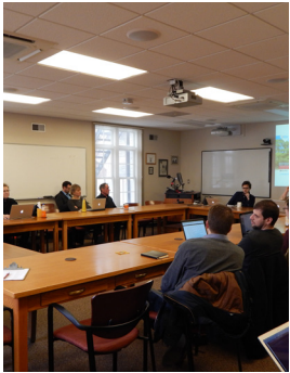
Colloquium Lecture Series

The Colloquium Series takes place on Mondays at noon and is a lively discussion of a presenter's unpublished paper. The Research Series on Wednesdays at noon provides a forum for visiting scholars and graduate students funded by the